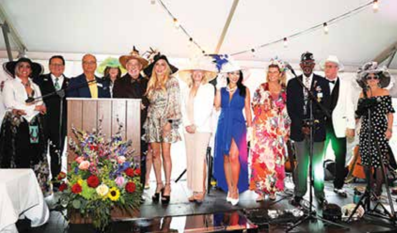
Above, Left: It's All About the Hats!

Thank You for Your Support of Our Signature Event!