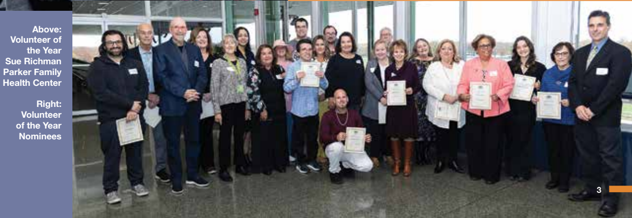
Right: Volunteer of the Year Nominees