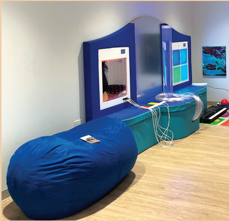
The Arc of Monmouth's Sensory Room funded by MPCF Winners Circle Society Transformational Grant.

The Arc of Monmouth held its new Campus Parkway Facility Ribbon Cutting ceremony on June 13, 2023, thanking MPCF for its Winners Circle Society Transformational Grant that funded the equipment for its new Sensory Room. This special equipment will benefit 125-150 adults with autism, Down Syndrome, and other intellectual/developmental disabilities, engaging their senses through fiber optics and tactile walls.